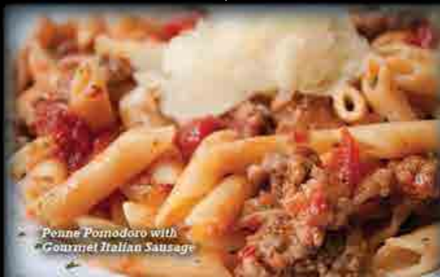
Penne Pomodoro with Gourmet Italian Sausage

Rosati's Lasagna contains cooked egg. Consuming raw or undercooked meats, poultry, or eggs may increase your risk of foodborne illness, especially if you have certain medical conditions. Cooking of such animal foods to recommended temperatures reduces the risk of illness.